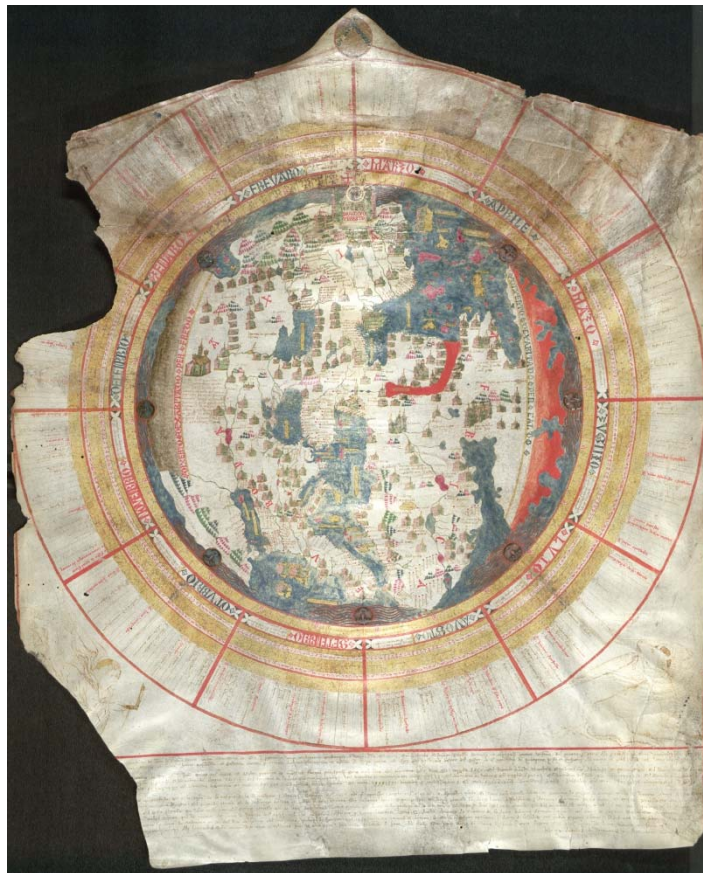
Leardo Mappa mundi 1452

This course introduces students to the cultural, intellectual, social, political, and economic changes in Europe between 1492 and 1815. We shall explore changes in the understanding of the human person—both body and mind—and of the universe; the repercussions of a global economy for different groups in Europe, the Americas, Africa, and Asia; the articulation of new forms of political power and economic organization; and the emergence of the modern sense of self.