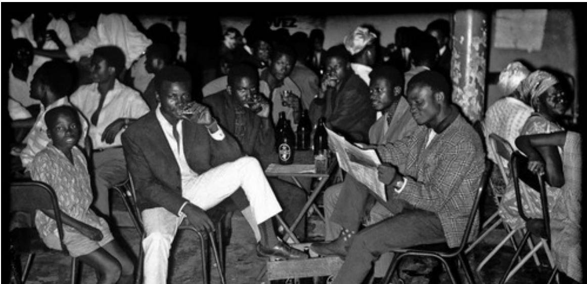
Untitled. Kinshasa in the 1950s.

Emmanuel Dongala, Johnny Mad Dog , a Novel (2005)